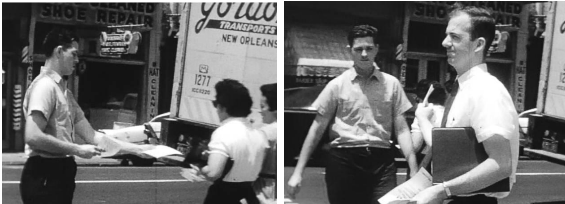
Oswald and a second man pass out pro-Cuba leaflets in New Orleans

June 16, 1963: Oswald and a second man pass out pro-Cuba leaflets in New Orleans. It has long been reported that Oswald was the only member of the Fair Play for Cuba Committee in New Orleans, yet film of his distribution of leaflets during June of 1963 clearly show Oswald with a second man handing out leaflets.