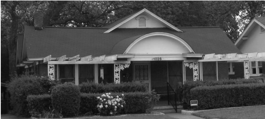
Oswald Boarding House at 1026 North Beckley, Oak Cliff, Dallas, imaged in 2015