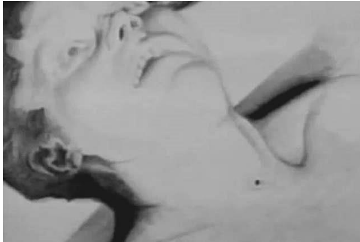
Parkland Hospital medical drawing of Kennedy's neck wound.