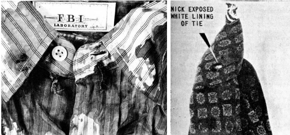
President Kennedy's shirt he wore on November 22, 1963.