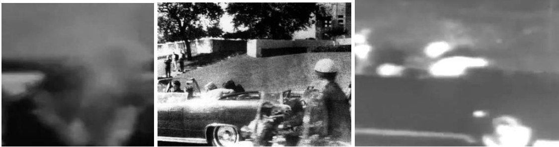
The fatal shot from three separate camera angles.

All of this physical and photographic evidence is consistent with the fatal shot coming from the front right, and not from behind. None of this evidence was included in the Warren Report. It was suppressed.